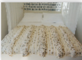
Moroccan Wedding Blanket

From aguayos to ikats to suzanis, 'exotic' handcrafted textiles are enjoying considerable popularity in Western interiors, and Moroccan Wedding Blankets are no exception. The creamy, sequined blankets, or handira, are a window onto traditional Berber culture.