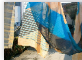
Recycled Sari Silk