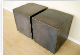
Hot Rolled Steel side table with raw exposed welds